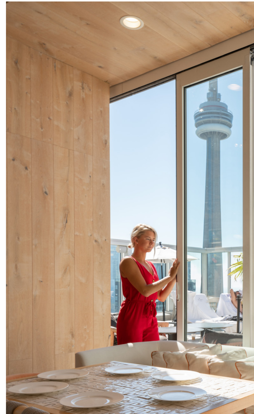
▲ Kost Restaurant, Bisha Hotel Toronto Architect: Studio Munge