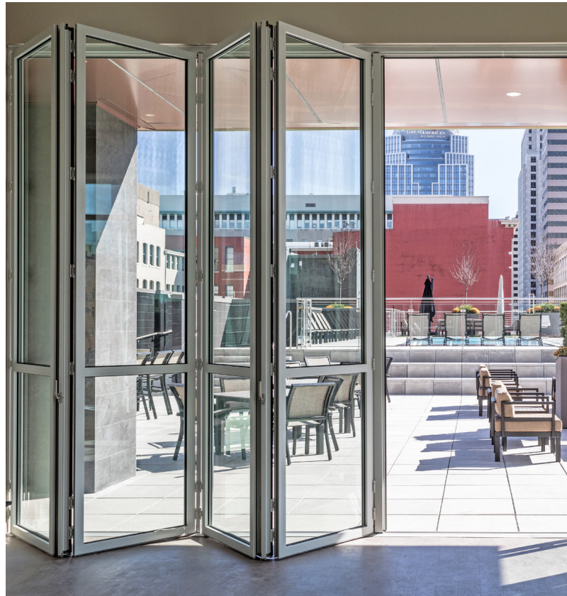
▲ Encore Urban Living, Cincinnati OH Architect: Neyer Architects

Amenities areas are where lodgers go to relax and socialize and as health and wellness is prioritized, incorporating the outdoors is paramount. Flexible glass walls in amenities areas, allow guests to enjoy recreation safely and comfortably in a post-pandemic world, facilitating indoor/outdoor spaces while augmenting the benefits of natural elements—not to mention the views.