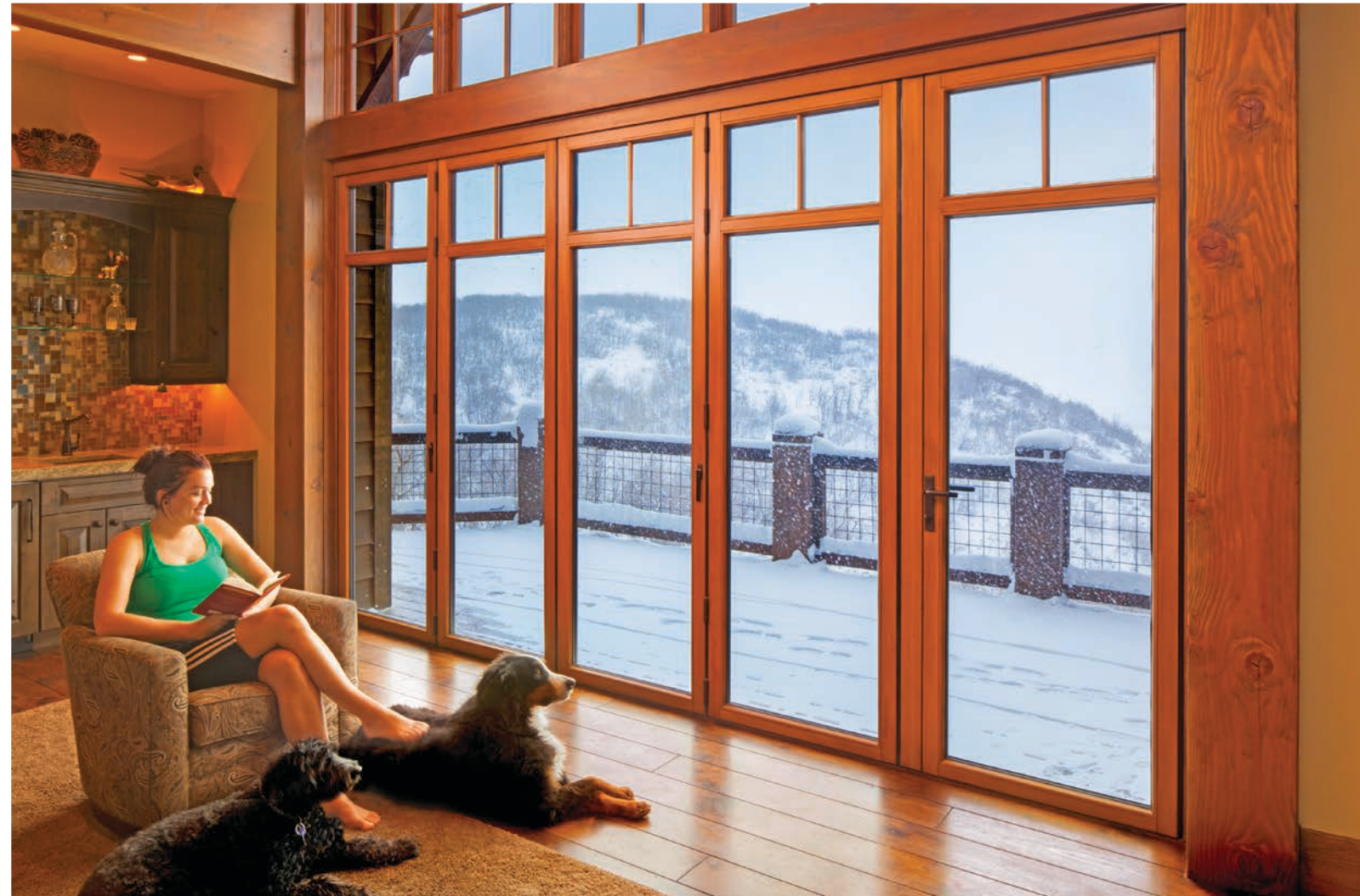
NanaWall Wood Framed Aluminum Clad Folding Glass Wall