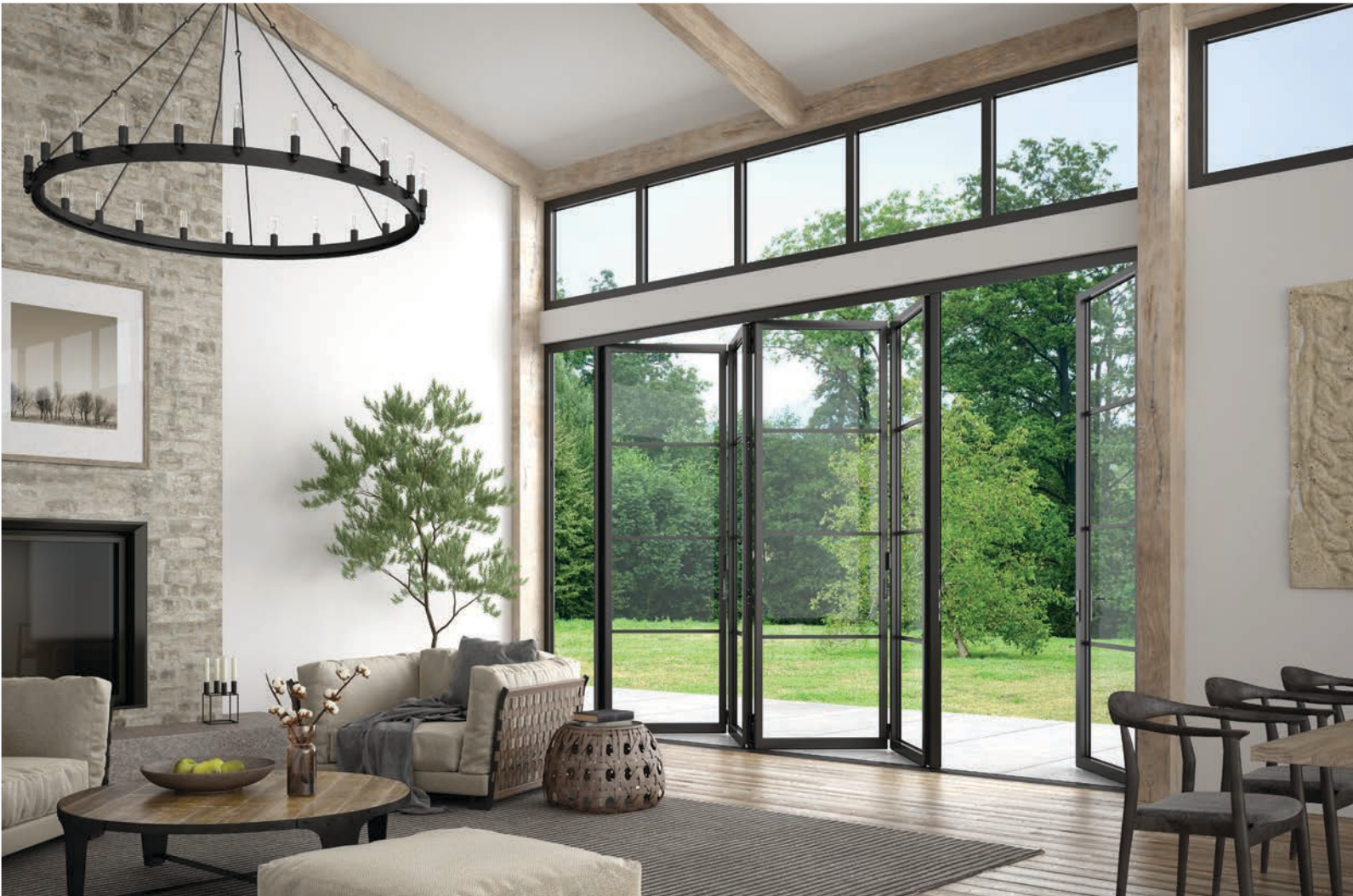
NanaWall Aluminum Framed Folding Glass Wall